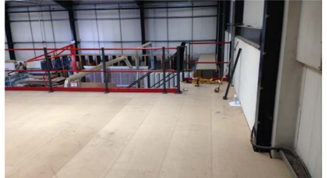
View from the top of the mezzanine (2016)

Technical Director, Formwise Washrooms Ltd