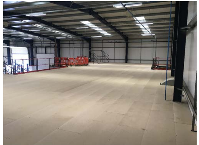
On top of the new mezzanine