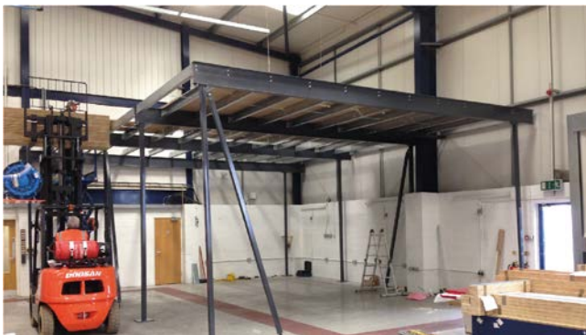
Mezzanine install in progress (2016)