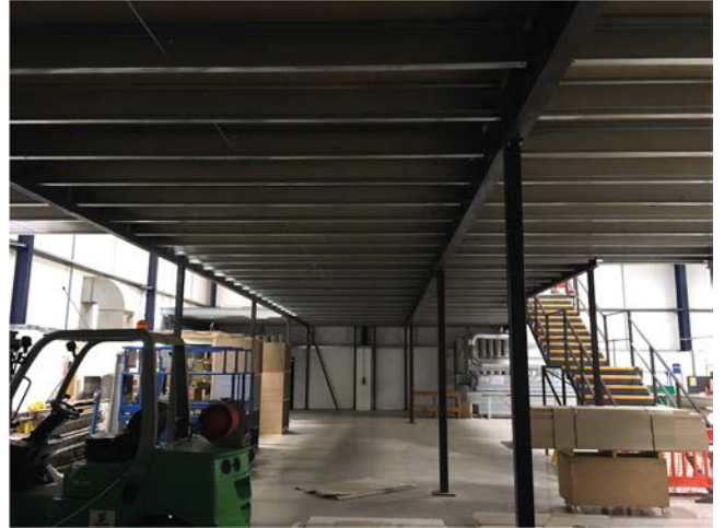
During the build