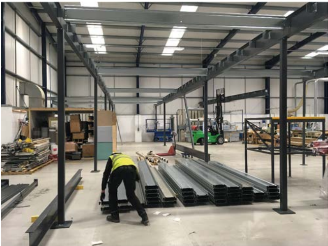
Structure is starting to appear