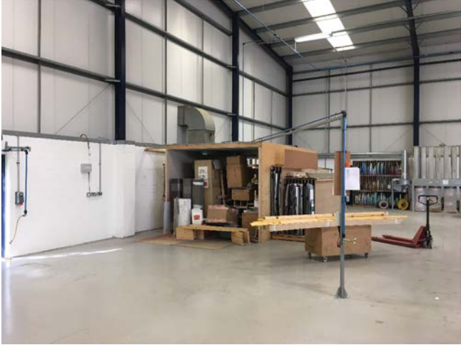
Before the build