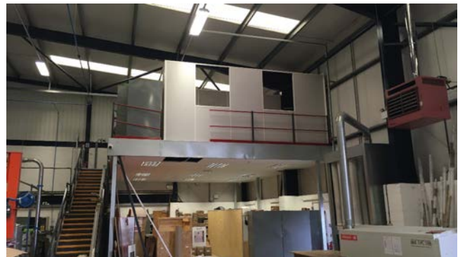
Creation of meeting room and canteen area - part of the retrospective fit out, and look the pallet gate has vanished! (2017)