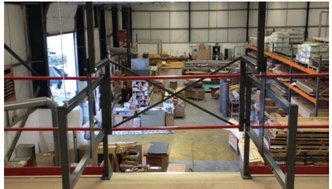
Pallet "up and over" gate in position (2016)