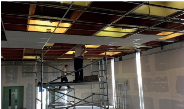
The first ceiling tiles go in