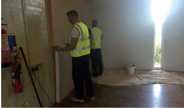
Fixing the new internal boards to the wall