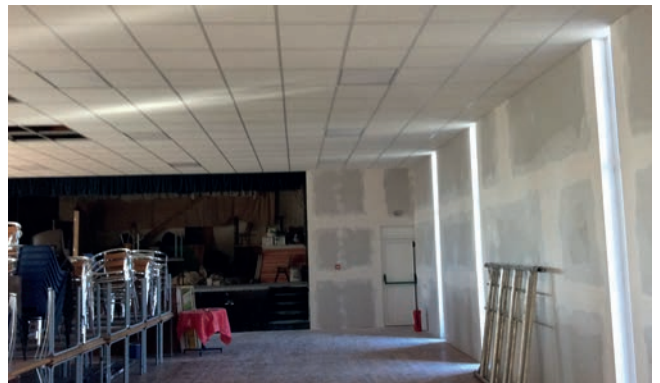
Ceiling is finally finished