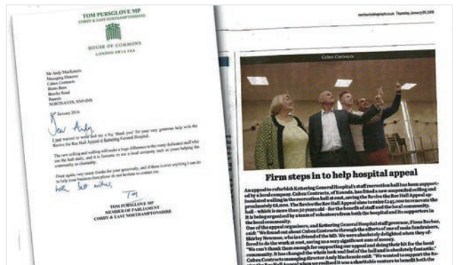
The letter from the local MP and copy of newspaper article