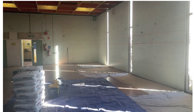
Painted brick walls

On behalf of the KGH Recreation Hall Committee