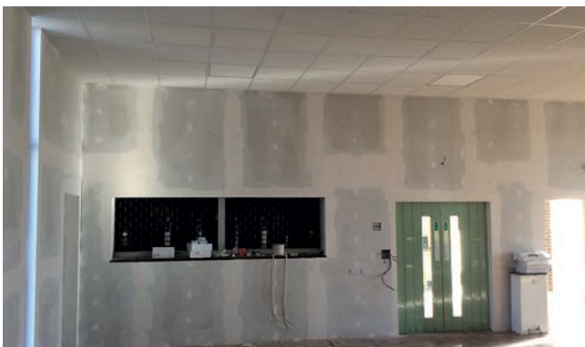
Feeling great after finishing both elements of our work for the project, ready to hand over to the next team