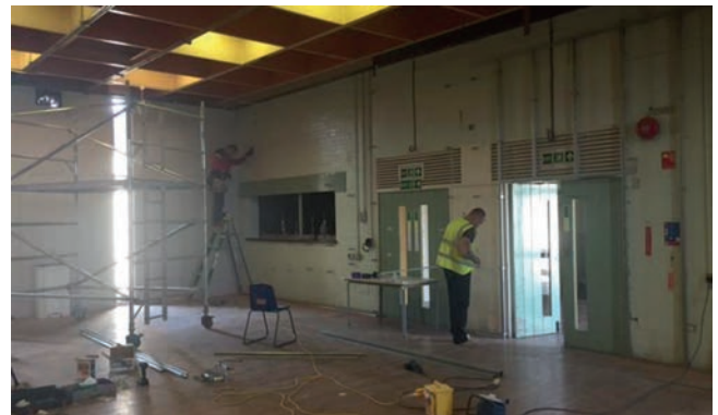
Putting up the framing for the new insulated boards