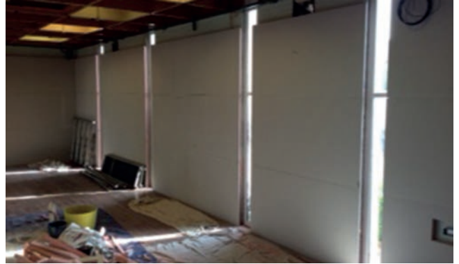
Walls finished and waiting for painting